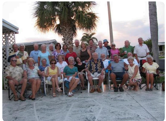
Picnic on the Fazakerley carport