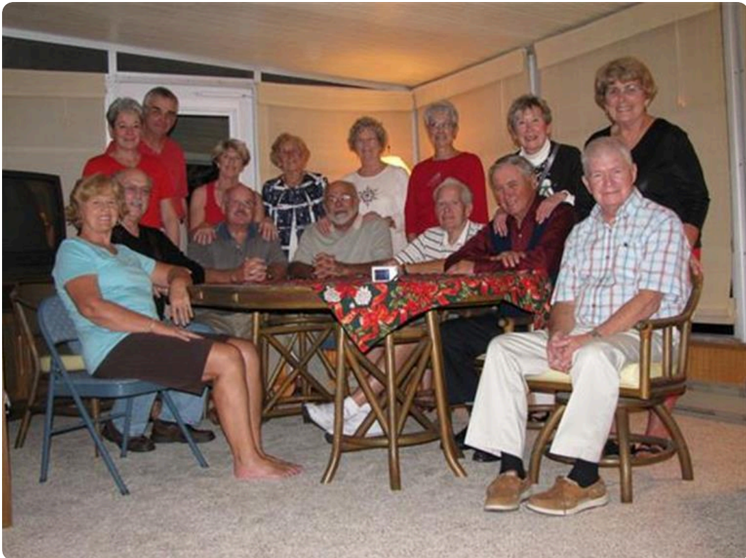
A Florida family Christmas Celebration