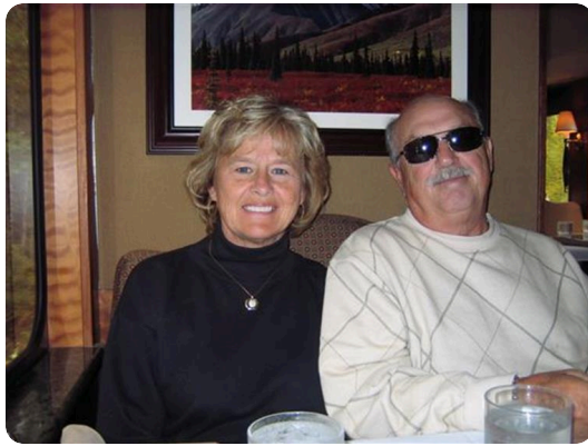
Train ride to Denali - Florida group Alaska tour.